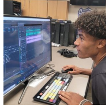
A junior in CHS' Audio/Video class edits a commercial's voiceover