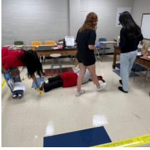
JHS' students at a mock crime scene begin their investigation