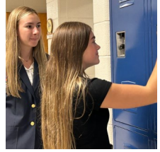
A student ambassador helps an incoming student with their locker