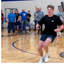
NWHS students at the Academy Kick-off cheer on their peers