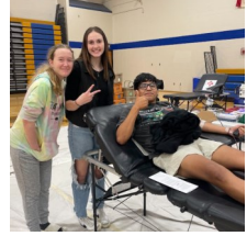
NWHS students support the Health Academy's annual blood drive