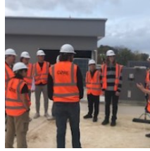
Engineering students at CHS inspect the roof of the new elementary