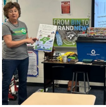
A guest speaker shares their career insights with Freshman at NWHS