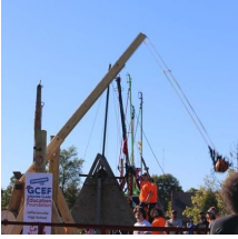
JHS students launch a pumpkin from their custom-built trebuchet